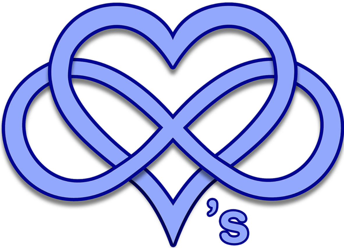
3D Design - Belonging to God